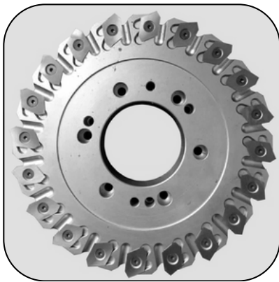
Book Spine Cutter

Along with large variety of straight knives, we offer book spine cutters and circular/rotary blades. We offer a wide selection of standard items, as well as custom-made solutions to meet your requests. Do you require more than knives and blades? We've got your covered. KAMADUR supplies a total solution for graphic and packaging companies at a competitive cost.